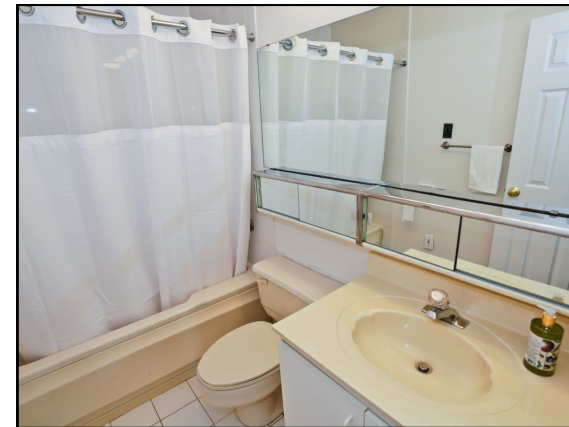
INCLUDES THREE BATHROOMS. Main bathroom includes jettied tub. Ensuite includes