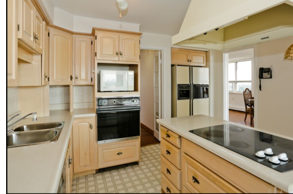
UPDATED KITCHEN INCLUDES ISLAND, BUILT-IN DESK AND NEW BOSCH DISHWASHER.