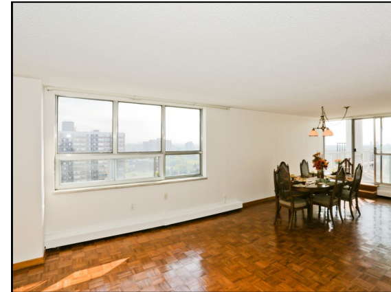
42.9 FOOT LONG LIVING-DINING ROOM COMBINATION—this space is HUGE!!!!