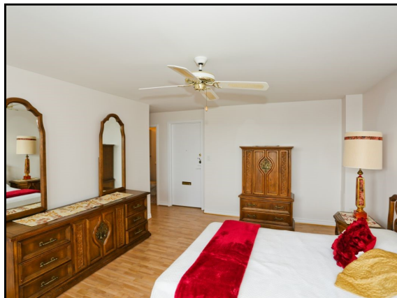
TWO LARGE BEDROOMS PLUS SEPARATE FAMILY ROOM (DEN). MASTER BR INCLUDES