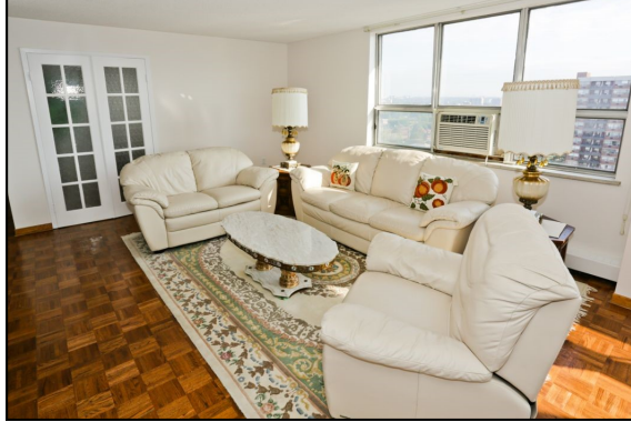
SUN DRENCHED LIVING ROOM INCLUDES PARQUET HARDWOOD FLOORING.