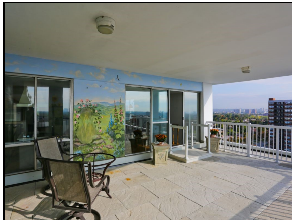
380 SQ FT ROOF TOP TERRACE WITH UNOBSTRUCTED SOUTH-EAST VIEW OF LAKE and CITY SKYLINE.