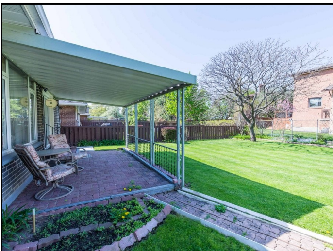
Expansive wood paneled lower level family room includes gas fireplace with stone mantle.