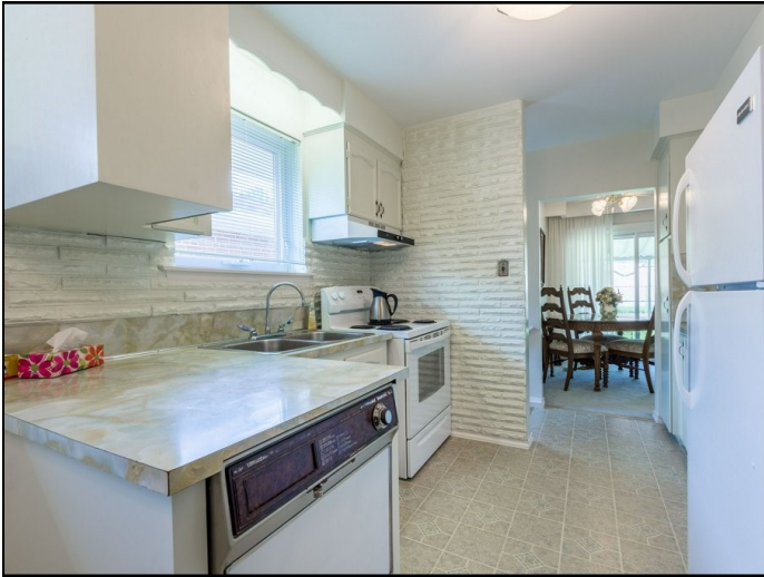
KITCHEN includes 3 appliances, pantry and large work area for food prep.