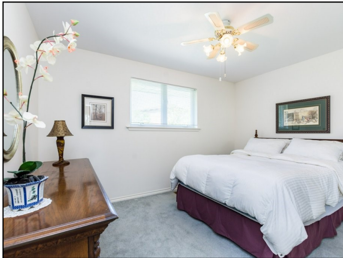
MASTER BEDROOM includes broadloom (over hardwood floors), ceiling fan and double closet. It overlooks yard!