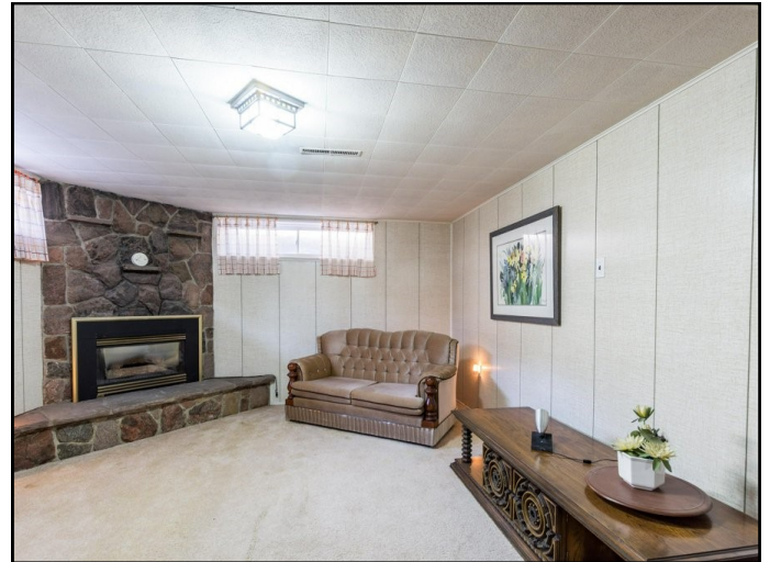
EXPANSIVE lower-level family room includes gas fire-place and above-grade windows!