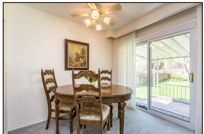
"L" Shaped Living—Dining Room area. Dining room walk-out to yard.