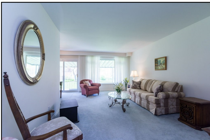
Large "OPEN" Living Room includes WALL OF WINDOWS. Hardwood Flooring (under broadloom)

Extras: Existing 'As Is' Sauna, Fridge, Stove, Dishwasher, Washer & Dryer. Hi-Eff Gas Furnace (14'), Central Air, Elf's, 5 Ceiling Fans, Broadloom (M/F Over Hardwood) W/Laid, Huge Covered Rear Patio, Garden Shed, Gdo & Thermal Windows. Ghwt(R).