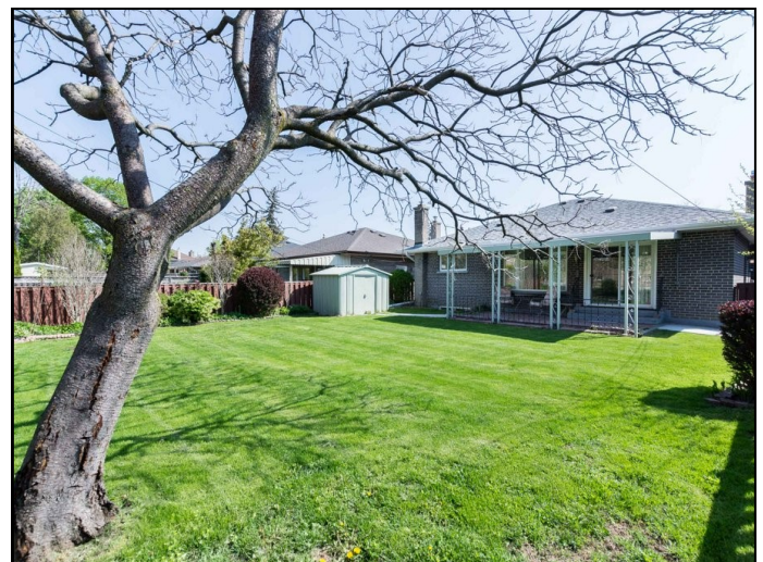
Wood paneled lower level dining room.