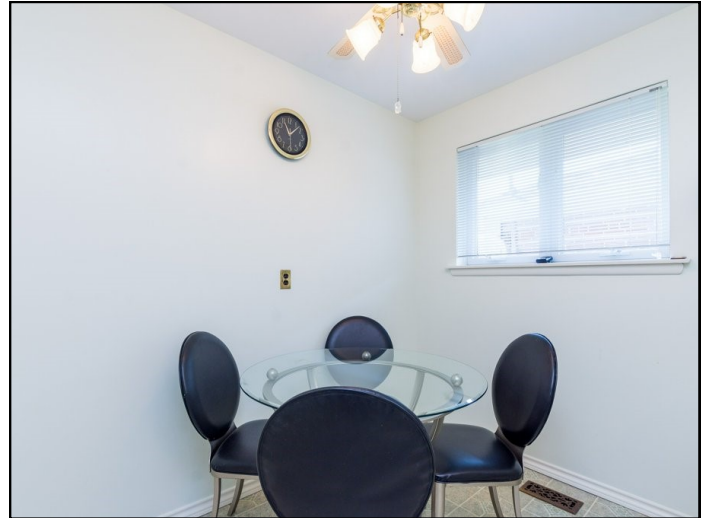
KITCHEN also includes separate FAMILY SIZED eating area