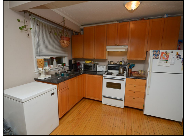
Open concept kitchen on main floor level is updated.