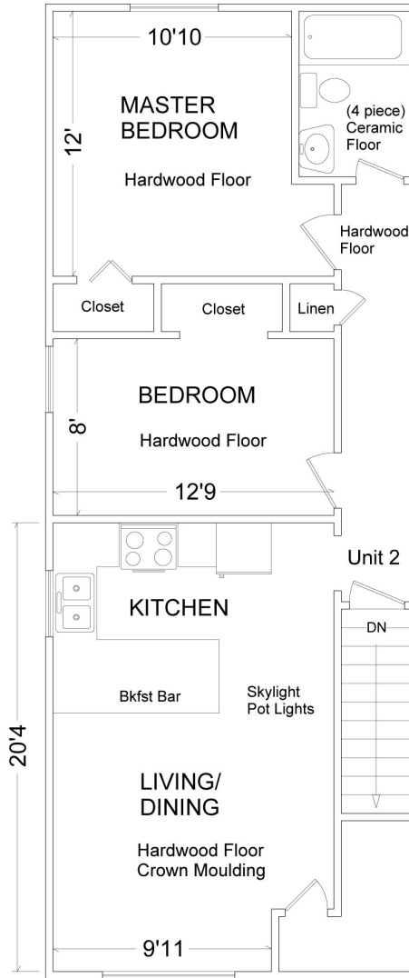
SECOND (760 sq ft)