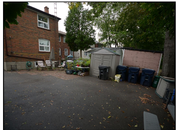
3 car parking is included in rear yard, that overlooks forested ravine.