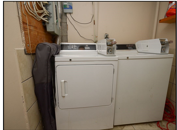
COIN-OPERATED LAUNDRY UNITS