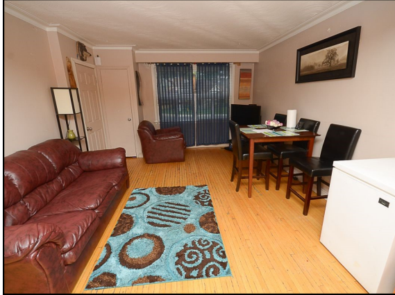
Upper living room & bright and spacious