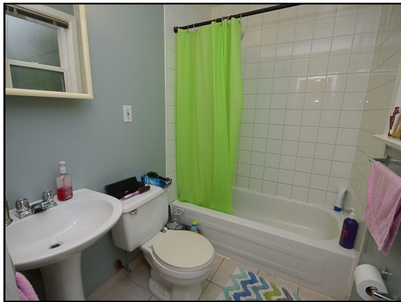
1 fo 3 RENOVATED BATHROOMS!