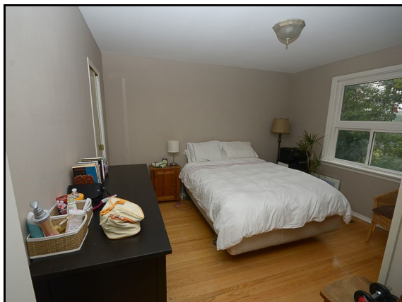
All 3 units includes 2 bedrooms.