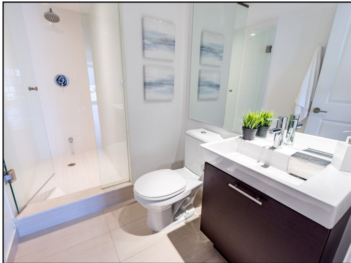
Main bathroom includes oversized Shower w/glass door.