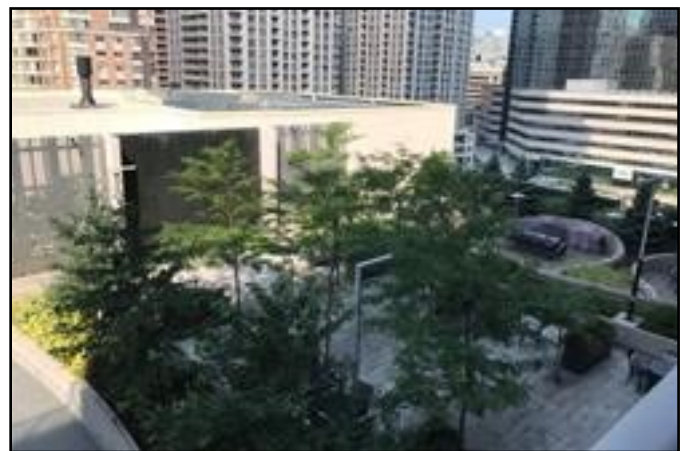
Roof Terrace! Other amenities include Guest Suites, 24 Hour Concierge, Lounge, Business Centre, Movie Theater, Billiards and Party Room to name just a few.