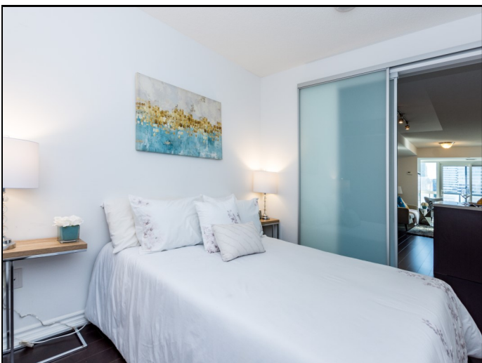
2nd bedroom includes frosted glass doors, wood floors and large clothes closet.