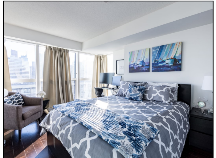
Oversized, south-facing Master BATHROOM includes wall of windows, walk-in closet and 4 pce. Ensuite Bathroom.