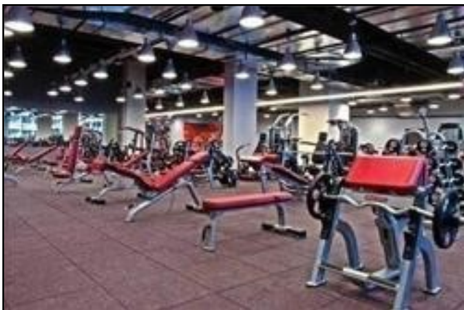
Full Membership to 42,000 Sq. Ft. CRUNCH Fitness Club is included with your Condo fees!

Client Remks: Aura At College Park. Unobstructed South City & Lake View. Open Concept 2 Bedrm. 2 Bathroom Suite With Wood Floors, Quartz Counters & Back-Splash And Floor-Ceiling Wall Of Windows! Next To 3 Acre Green Park And All Amenities Imaginable Including Underground Retail Stores And 42,000 Sf Crunch Fitness Club. Direct Access To College Station, College Park Shops, Restaurants, Financial District, Hospitals & Universities! Extras: Stainless Steel Fridge, Slide-In Range, Dishwasher & B/I Microwave Oven, Stacked Washer & Dryer, Wood Floors, Window Coverings, Light Fixtures, Balcony Decking, 1 Parking Space,