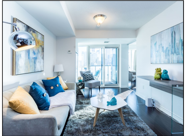
Open Concept Living room includes wood floors and walk-out south-facing open balcony.