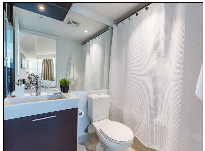
Master Bathroom includes tub + shower.