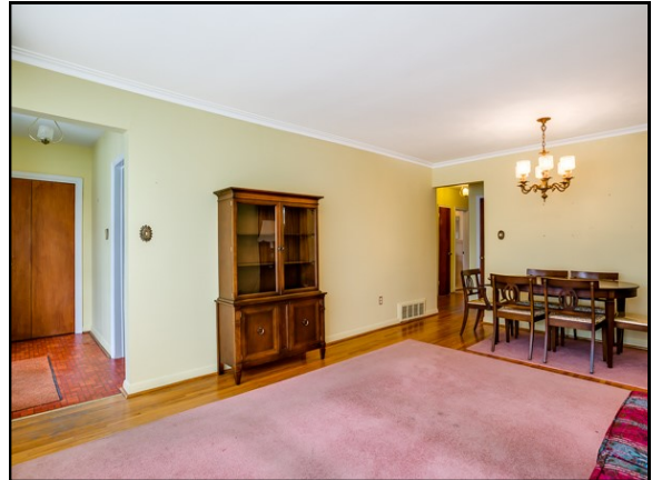
Dining room—Living room combination