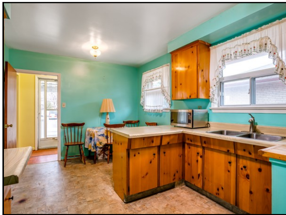
OVERSIZED eat-in kitchen includes separate dining area.