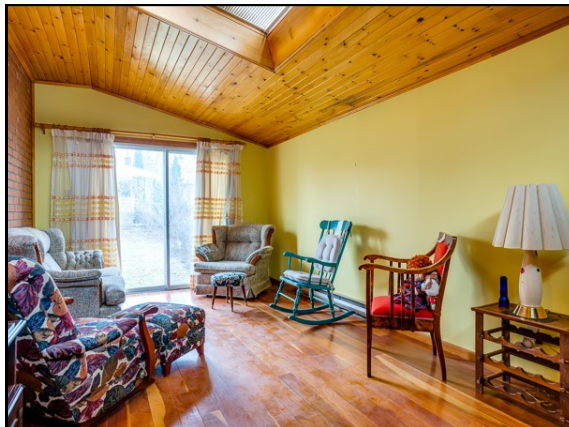
MAIN FLOOR family room addition includes sky-light and sliding door walk-out to yard.