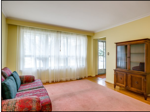
SUNFILLED living room includes hardwood flooring.