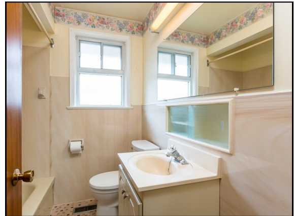
4 piece bathroom, on main floor