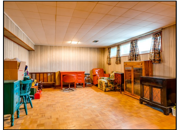
LARGE lower level recreation room includes parquet hardwood floors & above-grade windows.