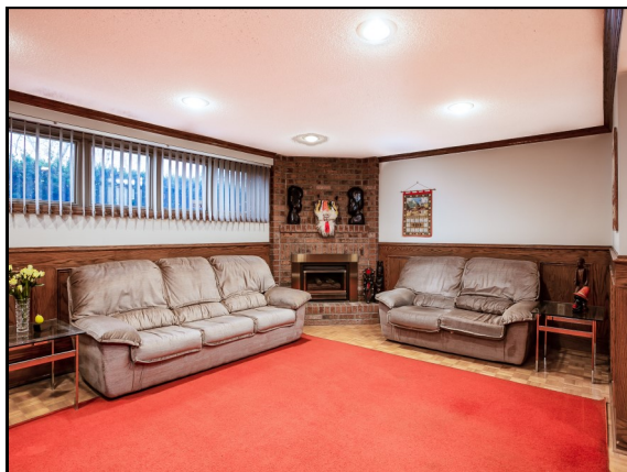
LOWER level FAMILY ROOM includes raised floor w/hardwood flooring, custom wood paneled wainscoting, b/I bookcase, custom bar & gas fireplace. GREAT FOR ENTERTAINING!!!!