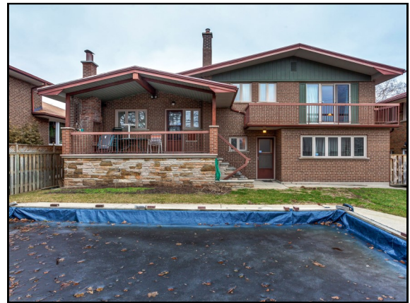
WEST FACING rear yard includes in-ground swimming pool with concrete decking!