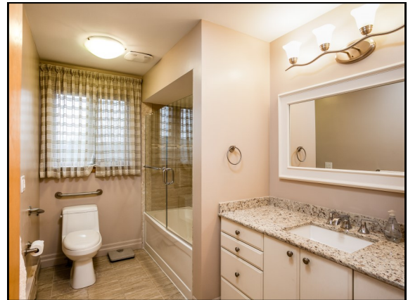
THREE BATHROOMS: Both the MAIN (pictured here) and the lower powder room bathrooms have been recently renovated!