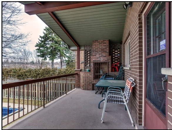
LARGE 5.4 x 2.5M covered concrete verandah includes outdoor fireplace and overlooks yard & swimming pool!