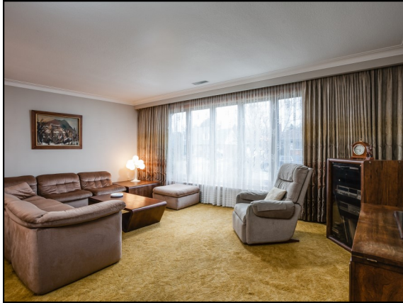
Spacious "L" shaped Living Room and Dining room includes oversized picture windows.