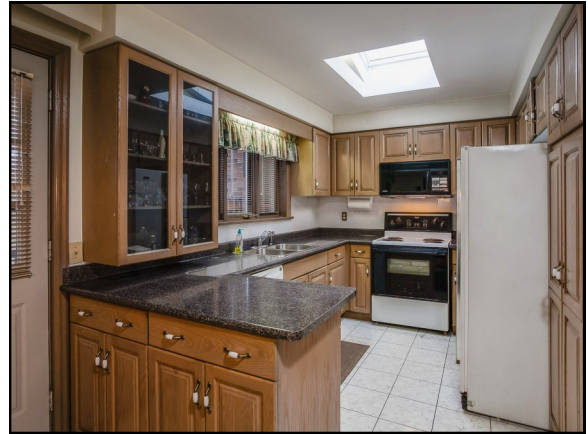
Eat-in Kitchen includes all appliances, sky-light, Separate dinette area and walk-out to yard.