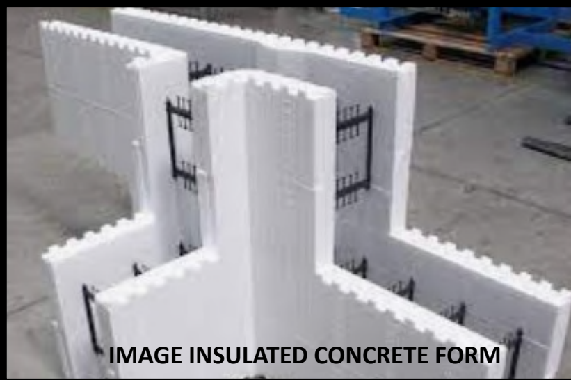
IMAGE INSULATED CONCRETE FORM