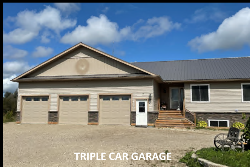
TRIPLE CAR GARAGE