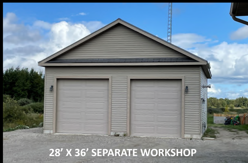
28' X 36' SEPARATE WORKSHOP