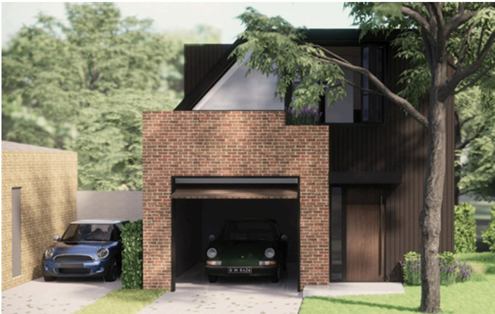
Single-vehicle laneway house from Toronto's Eva Lanes - www.evalanes.com

A basement is also possible, adding to the square footage above, but in most cases the floor plate of the basement will be significantly smaller than the ground floor and upper floors, the space cannot usually contain bedrooms or a bathroom or a kitchen, and the cost of basement construction can be significant.