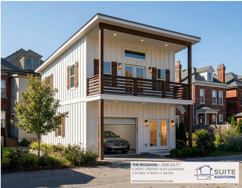
2-storey laneway house from Suite Additions

The relatively new (2018) Changing Lanes program from the City of Toronto allows qualifying property owners to construct a laneway house “as of right” on their property, with simple building permit application and no political approval or committee of adjustment approval required. No variances are required and no appeals or “neighbour vetoes” are permitted. The city also waives development cost charges.